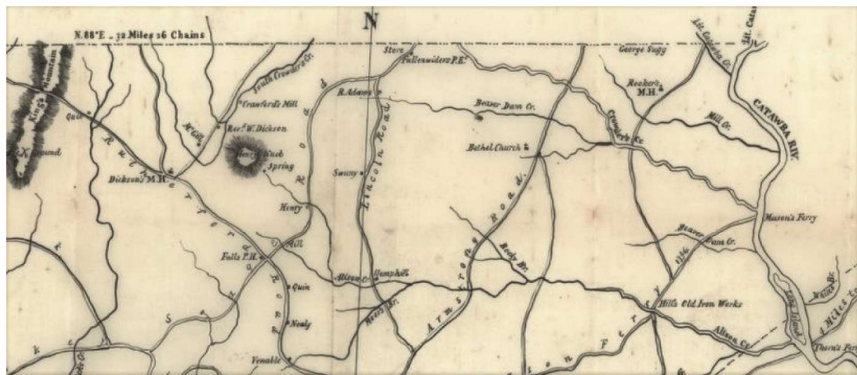
Closeup of Mill, Crowder's, and Little Catawba Creeks from 1825 York District Map